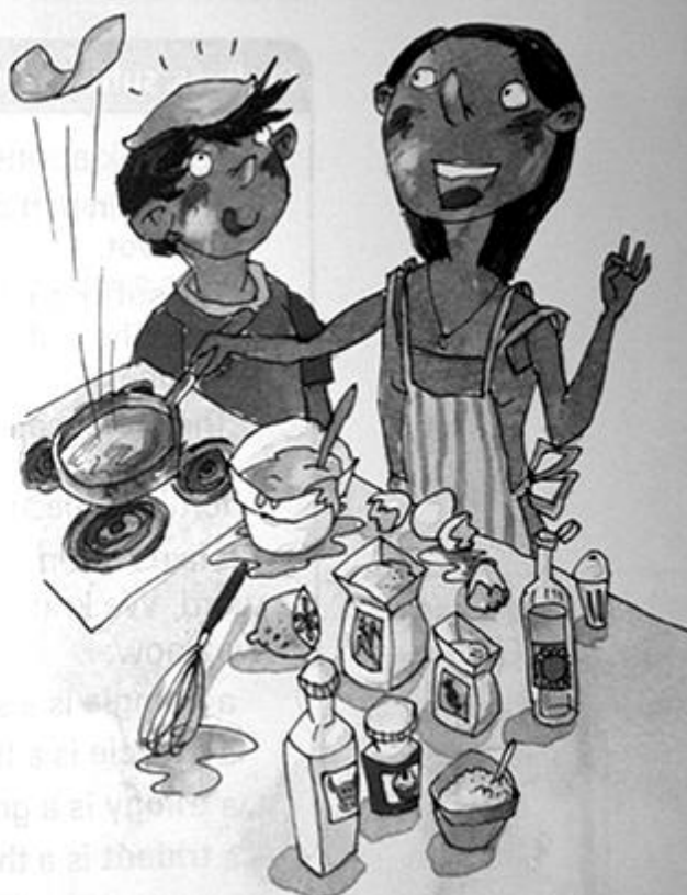
Cooking up a storm!

We're gonna cook up a storm of about 10 lip-smacking, mouth-watering pancakes. In a large mixing bowl, sift together one cup of fresh cake flour, one teaspoon of baking powder and some salt. Now find another bowl and mush two hen's eggs, three quarters of a cup of milk, 150 ml of water and a bit of freshly-squeezed or bottled lemon juice. The lemon juice will add a lekker tang to the taste! When this is thoroughly mixed, whack it into the sifted bowl of dry ingredients and mix very well, like a cement mixer would. Now add 100 ml of sunflower oil and beat up the mixture until it is smooth like silk. Let it chill for half an hour so that it can settle. On the stove, heat a non-stick frying pan and use a large ladle to scoop up the batter. Cook the pancakes one at a time and flip or turn them carefully. Slap some sugar and cinnamon on, roll 'em up and stuff 'em down while they're hot.