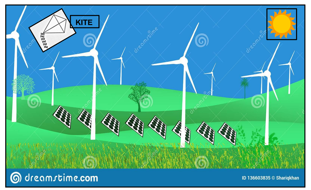
FIGURE 2.5: NON CONVENTIONAL SOURCES OF ENERGY