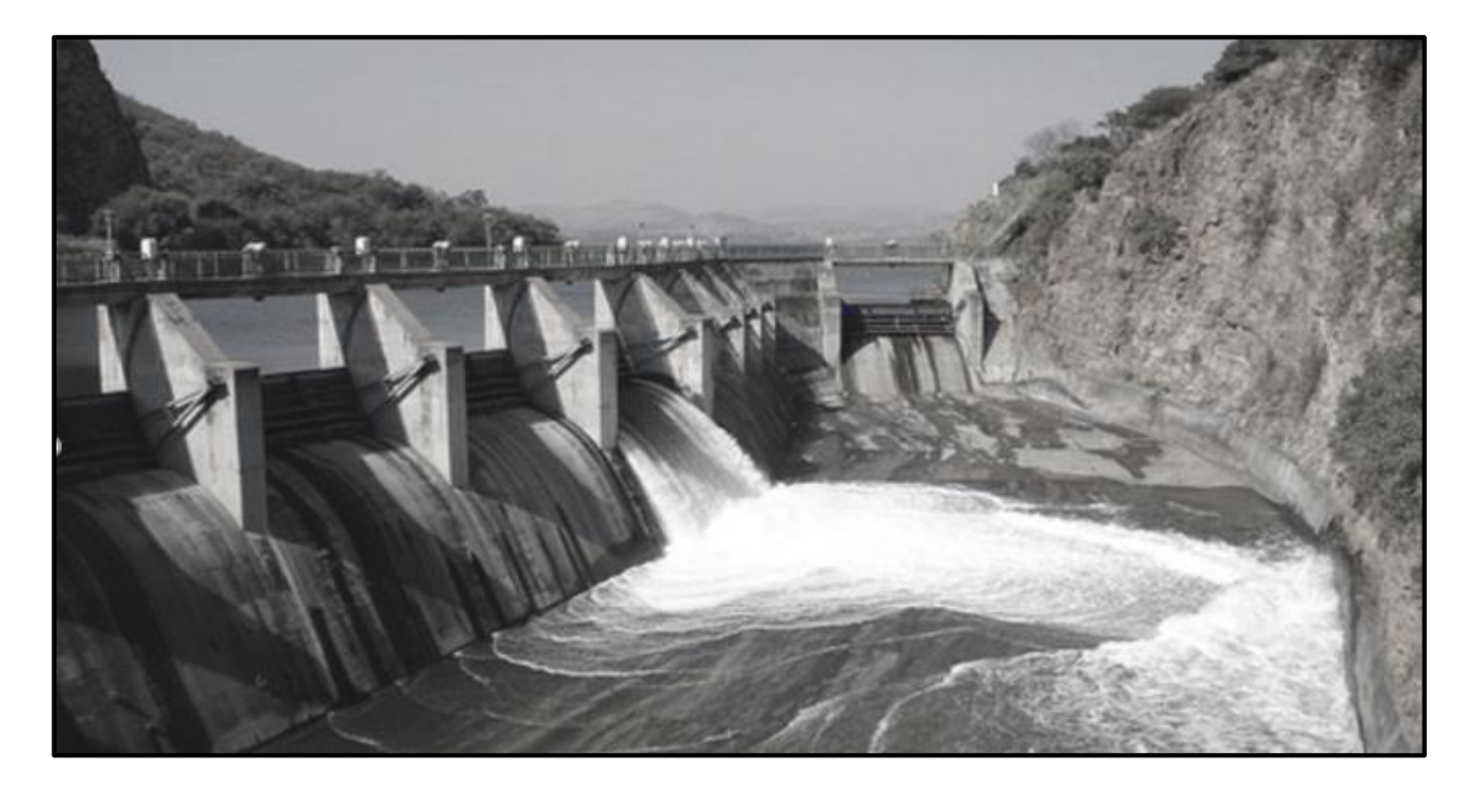
FIGURE 3.6: HARTBEESPOORT DAM WALL