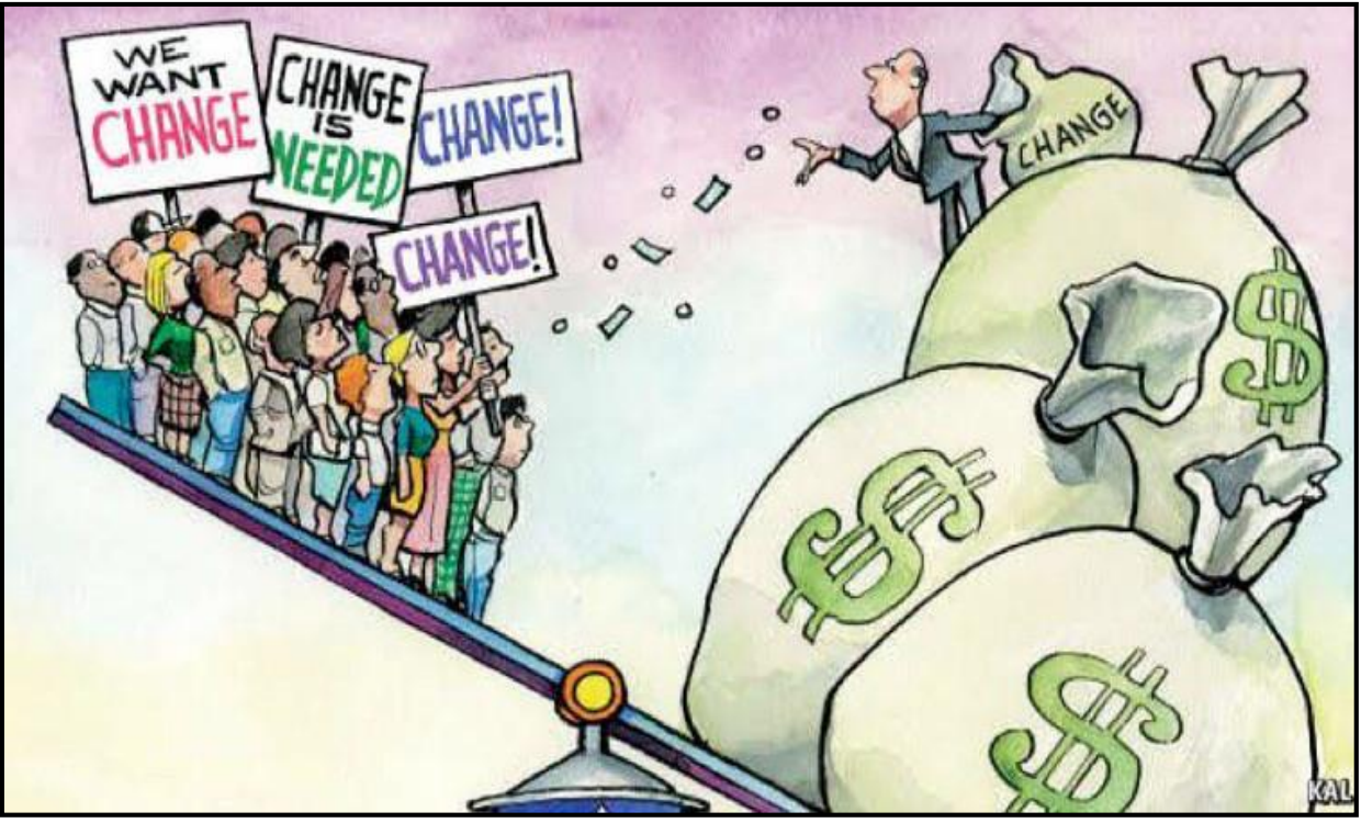
FIGURE 1.3: ECONOMIC INDICATOR OF DEVELOPMENT